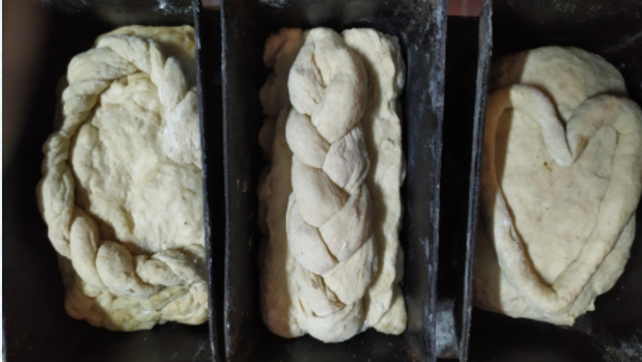
Pupils baked bread